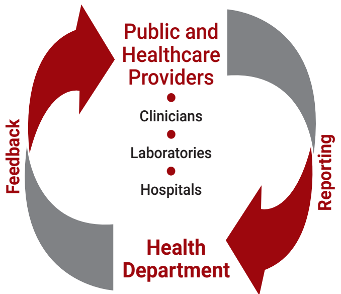
Figure 2: Disease Surveillance Cycle CDC ATLANTA