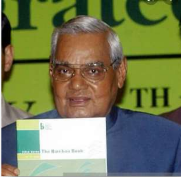
Atal Bihari Vajpayee Hon' ble Ex- Prime Minister of India

"I do not say that my interest in bamboo owes to this association but I have to admit that I have always been fascinated by bamboo, which rightfully deserves its nickname ' Grass ' - 7th World Bamboo Congress in New Delhi.