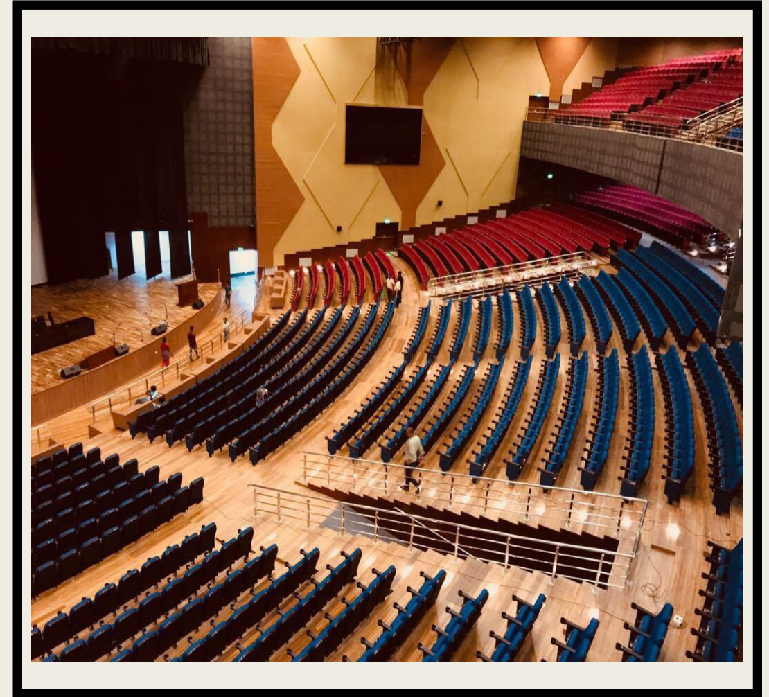
SAMRAT ASHOKA CONVENTION CENTRE PATNA