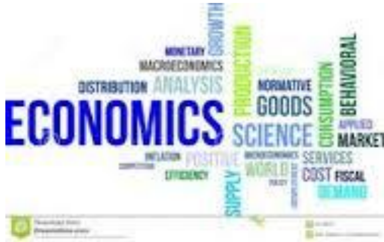
TABLE OF CONTENTS-APRIL 2018