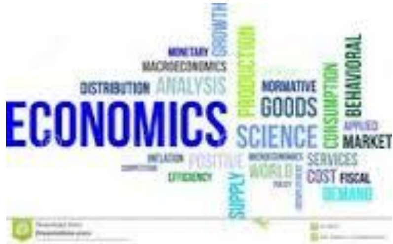
TABLE OF CONTENTS–NOVEMBER 2017