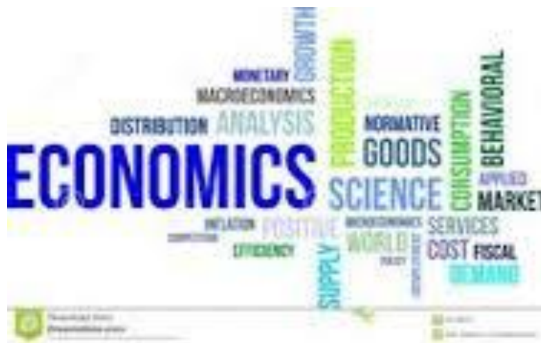
TABLE OF CONTENTS–JUNE 2019